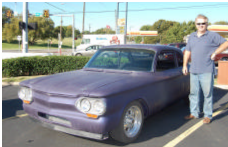
Harold Hopp and early V-8 conversion