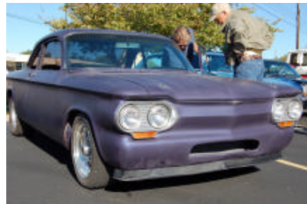
V-8 Corvair conversion. Note radiator