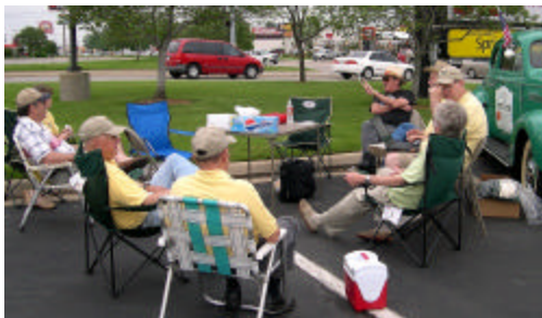
GCCG Members talking "shop"