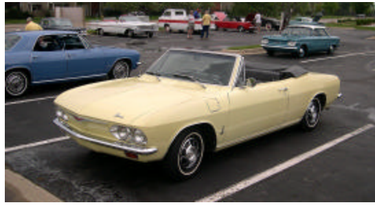
Glen Bevel's 65 convertible