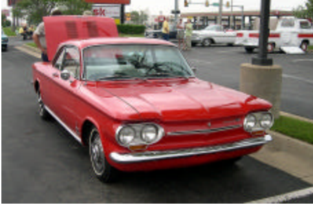
Bob Mooney's 63 turbo coupe