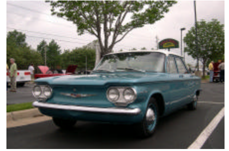
Marvin Luke's 60 four door sedan