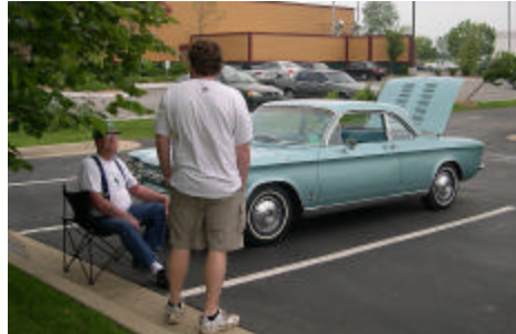
Bob Kinser's 64 coupe