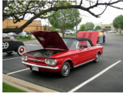
Roger Scott's 63 convertible