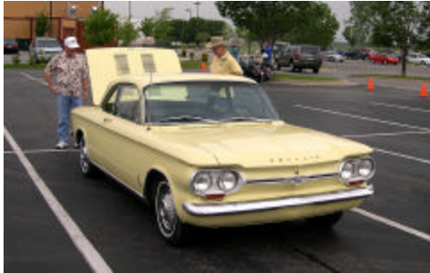
Gary Upton's 64 coupe: Three speed manual