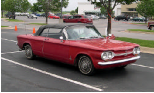
Van Upky's 64 convertible