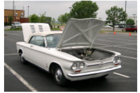
Lloyd Verrett's 64 convertible.