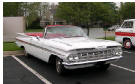
Marvin Luke's 59 Impala convertible