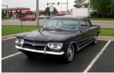
Jim Brewer's 64 turbo coupe