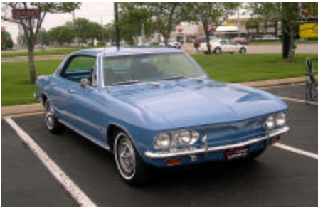
Forrest Andrew's four door hardtop