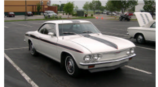
Gary Baxter's 65 coupe.