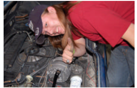
The Culprit’s Satisfied Owner