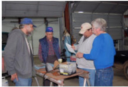
The Culprit Conspirators