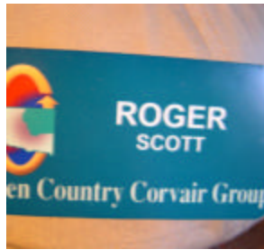
Name Badge with your name