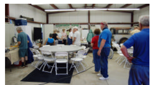
More hungry Club members