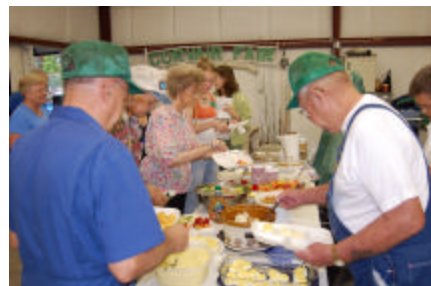
Hungry Club members